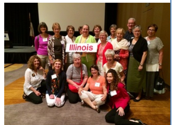
LWVIL delegates to LWVUS convention

LWVIL include revisiting the League’s position on charter schools, voting rights restrictions, climate change and mental health. For more information, go to the LWVIL website http://www.lwvil.org .