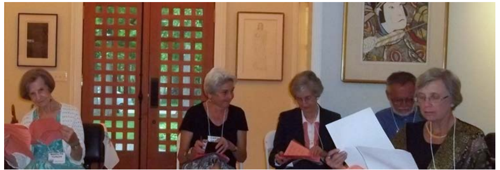
Members study issues at the annual meeting

We're looking forward to a productive and successful year!