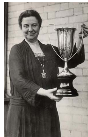
Miss Belle Sherwin, President of the National League of Women Voters, holding silver loving cup to be awarded by the National League to the state League showing the greatest percentage in increase of vote of 1924 over 1920.

Cost is $45 ($25 for continental breakfast and the morning session, $30 for the lunch and workshop). Reservations are due February 11, 2008. For more information, visit www.lwvil.org or call (312) 939-5935.